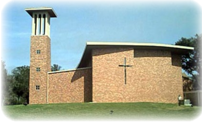
ST. ANN CATHOLIC CHURCH